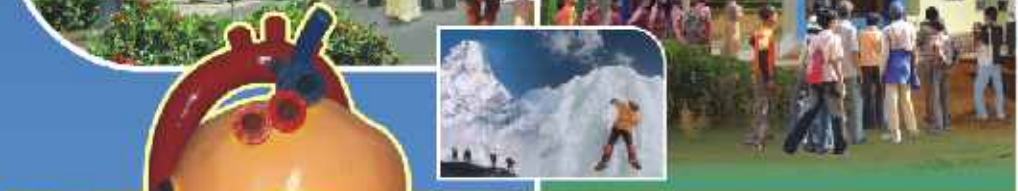
Interactive Science Exhibits